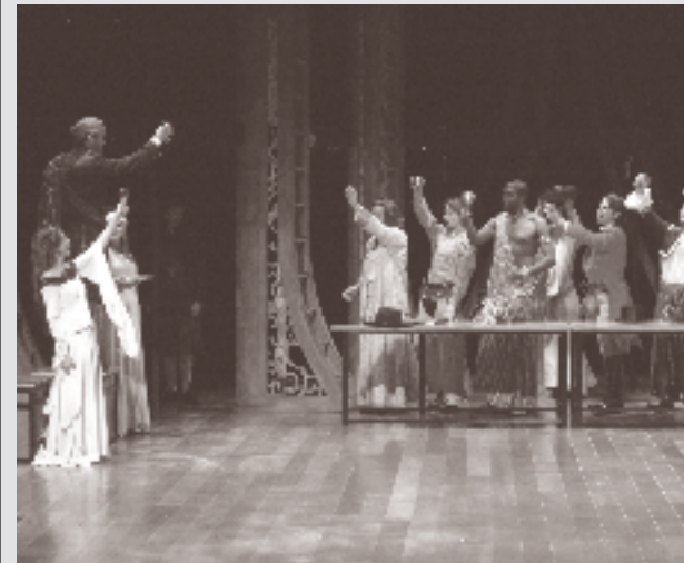
The cast of Pericles . (Bill DeLoach)